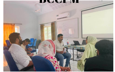
Doctors Practicing Communication Skills During a Role-Play Session

The Basic Certificate Course in Palliative Medicine , organised by IPM WHO CC, is a six-week program for doctors. This is designed to equip the participants with practical skills and knowledge in palliative care. The course covers a range of vital topics including communication skills, pain management, spiritual care, and ethics in medical practice.